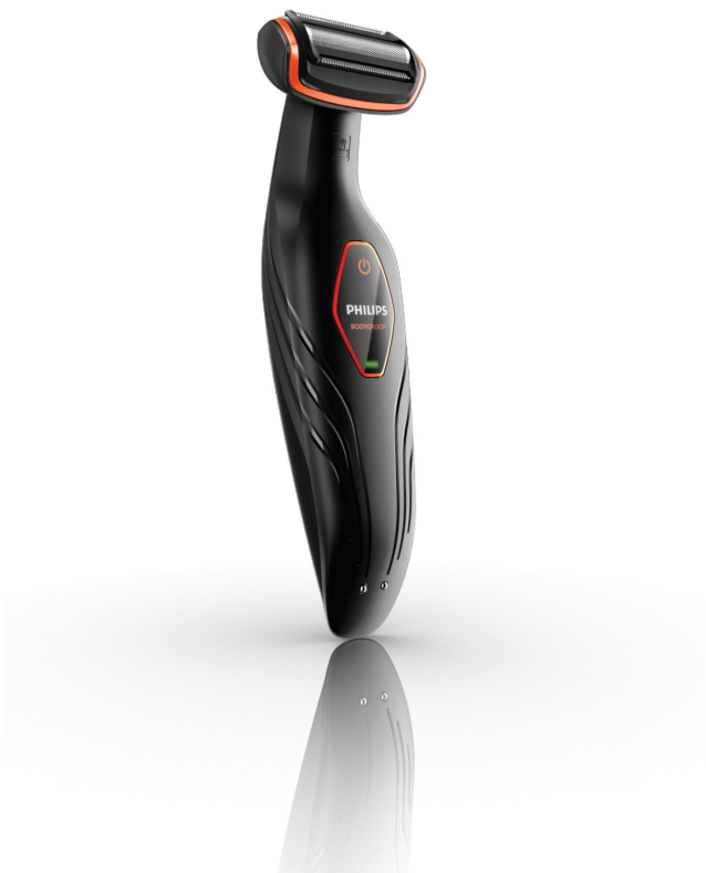
Philips Bodygroom body groomer