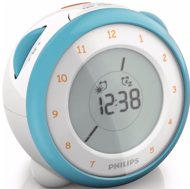
Philips Alarm clock